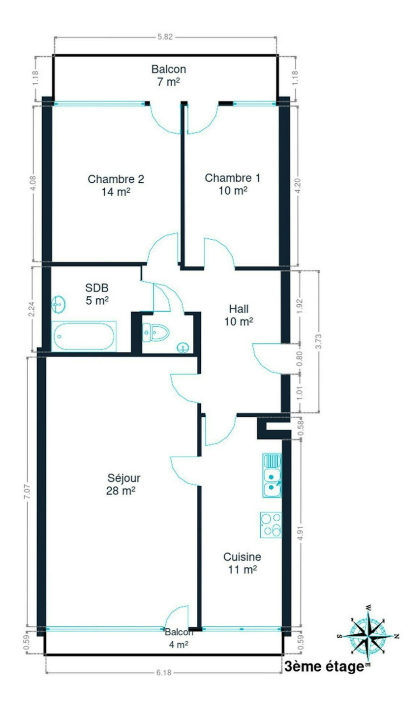
Les plans sont soumis à titre informatif et non contractuels.

Little tip: measurements are not always 100% perfect. A margin of error should be taken into account. So, before puzzling over your favorite wardrobe, apply a safety margin!